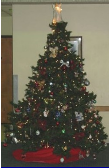
Holidays at the Carl D. Perkins Vocational Training Center